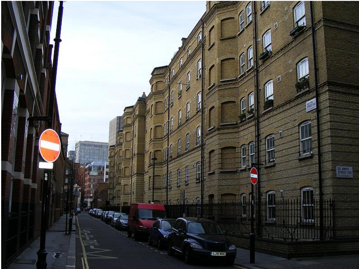
Peabody Buildings, Old Pye Street, London