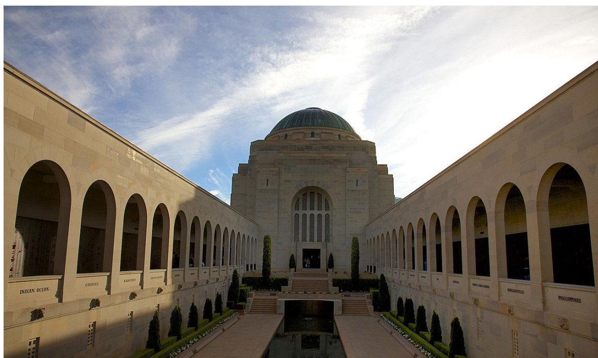
Commemorative Area of the Australian War Memorial