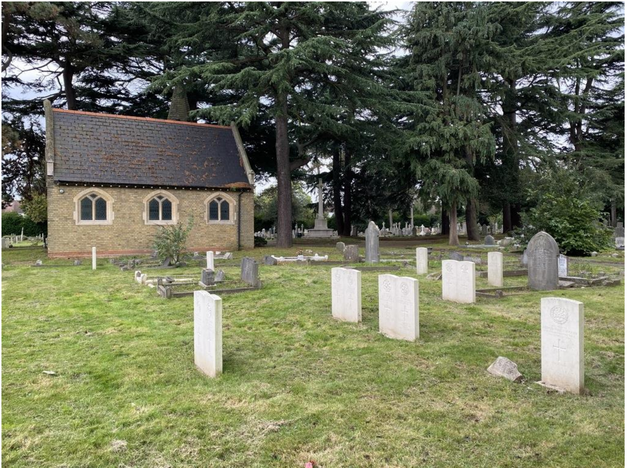
New Brentford Cemetery, Hounslow