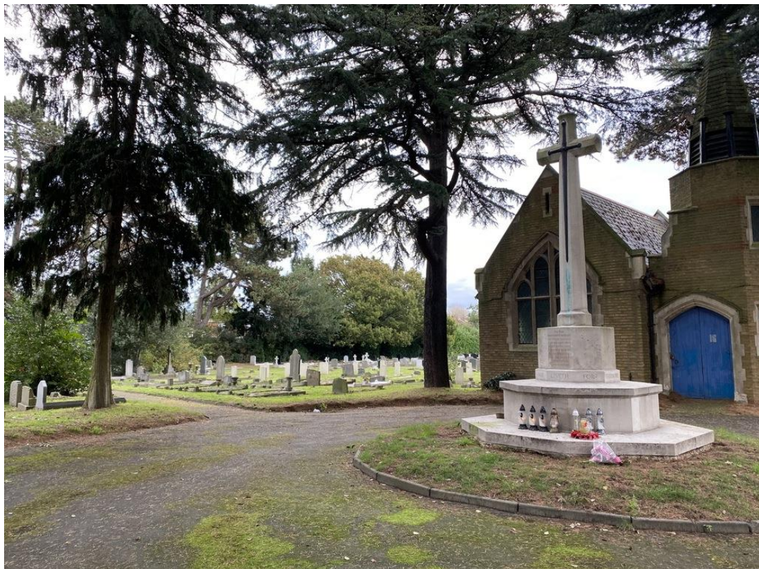
New Brentford Cemetery, Hounslow

New Brentford Cemetery, Hounslow, Greater London contains 56 Commonwealth War Graves – 54 relating to World War 1 & 2 relating to World War 2.